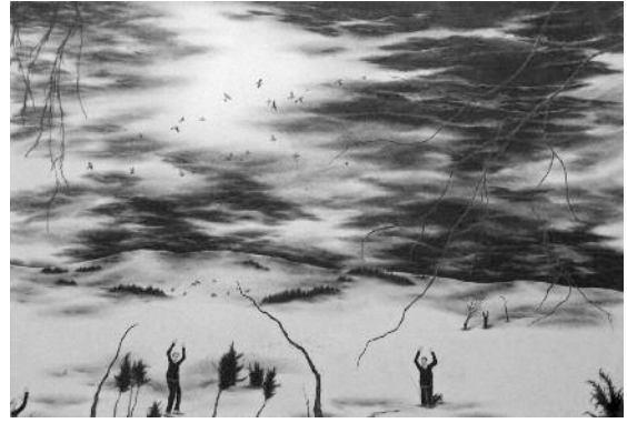
The Pre-Conference with an Unfair Fight in the Back, 2004, pencil on paper, 7.5"x10"

Top: This Seething Devotion, This Ignition of Fear, 2004, graphite on paper, 20" x 32"